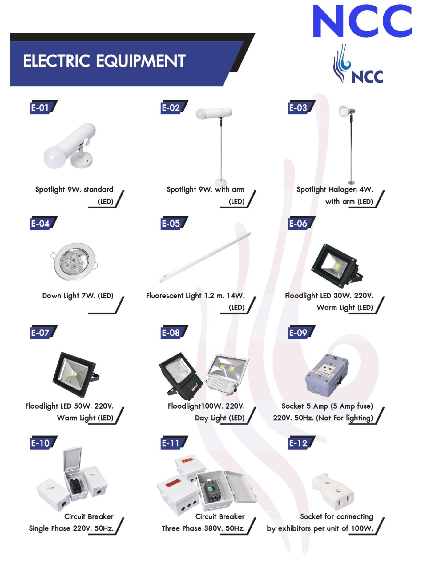
N.C.C.Management & Development Co.,Ltd.