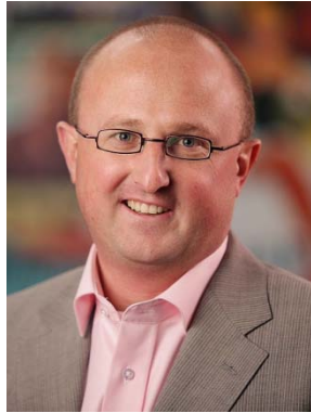
Wouter Dekkers Movie Park Germany Warner Allee 1 46244 Bottrop-Kirchellen Germany