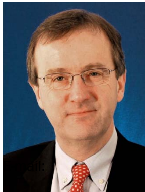
Mike Brown Blackpool Pleasure Beach Ocean Boulevard, Promenade Lancashire FY4 1EZ Blackpool United Kingdom