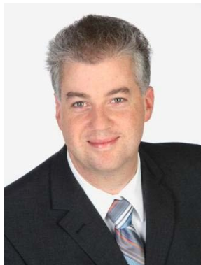
Markus Koenig Europa-Park Europa-Park-Strasse 2 77977 Rust / Baden Germany