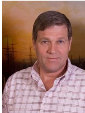
Gary Smart Harbour Park Sea Front BN17 5LL Littlehampton United Kingdom