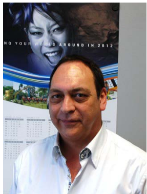
Har Kupers Vekoma Rides Manufacturing Schaapweg 18 6063 BA Vlodrop Netherlands